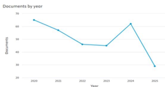
Gambar 1. Trends in Publication of mHealth Articles

mHealth Article Publication Trends The publication of mHealth articles shows a significant downward trend from 2020 to 2023, from 65 to 45 articles. Although it increased to 62 articles in 2024, the number dropped again drastically to 26 in 2025, because the data was collected in March 2025 so it could still increase. This decline is due to several factors: the peak of attention occurred during the COVID-19 pandemic, while post-pandemic research focus shifted to topics such as AI, precision medicine, and big data; many mHealth studies are still exploratory and have not shown long-term impacts; and issues of ethics, data privacy, and digital technology regulation hinder further publication.